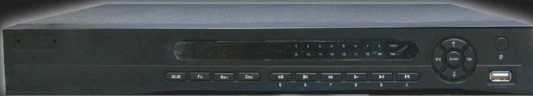
VS-DVR808 / VS-DVR816

VS-DVR804: 4 channel video inputs and 2 channel audio inputs. It can support CIF realtime recording or D1(4CIF) recording with 6/7fps. It can support TV, VGA and USB2.0.